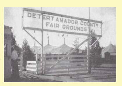
elsewhere in the county and saw first modern-day county fair in 1938.

Afterwards, seemingly various civic or ethnic celebrations compensated for the loss but surely Amadorians periodically pined into the depression years over their fair. But not until 1937 did hopes rise in Plymouth to replace it. Maybe the city and its progressive citizens had looked The sign and background tents of the the annual lone and Italian