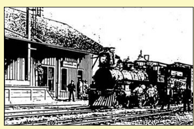
Ione Depot, Ione California

At over 125 years old, the historic Ione Depot is finally getting prepared for a move. This building was constructed by the Central Pacific Railroad in 1876 in conjunction with the construction of the Ione Branch from Galt to Ione. The building was donated to the City of Ione a few years ago. It currently sits on